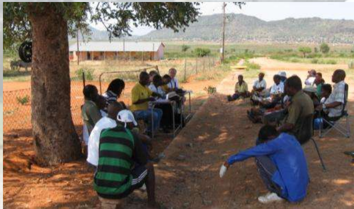
April 8, 2010