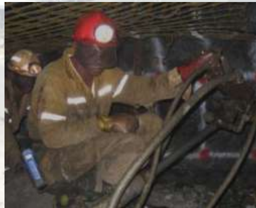
3rd PGM RT - Guyancourt