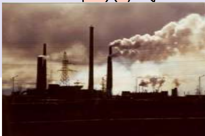
3rd PGM RT - Guyancourt

2. loss of strategically important metals